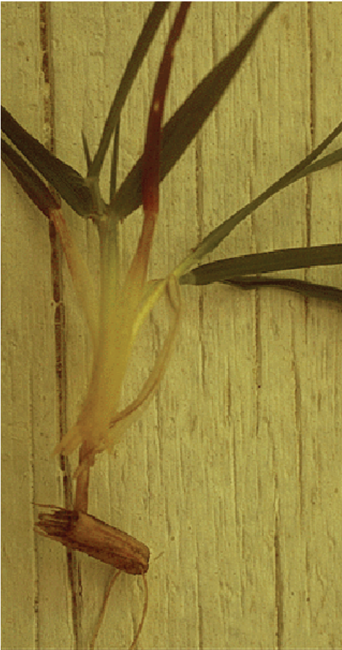
Figure 3. An effective method of distinguishing between vegetative jointed goatgrass and wheat is to dig up the plant and look for the spikelet (joint) attached to the root of jointed goatgrass.

Jointed goatgrass reduces winter wheat yields by competing for moisture, light, space and nutrients. At Akron, Colo., winter wheat yields declined by 28 percent when jointed goatgrass at a density of 15 plants per square yard emerged with wheat in the fall. When it emerged at the same density in early spring, wheat yields declined by 8 percent. At North Platte, winter wheat yields declined by 0.4 percent for every jointed goatgrass plant per square yard that emerged in the fall.