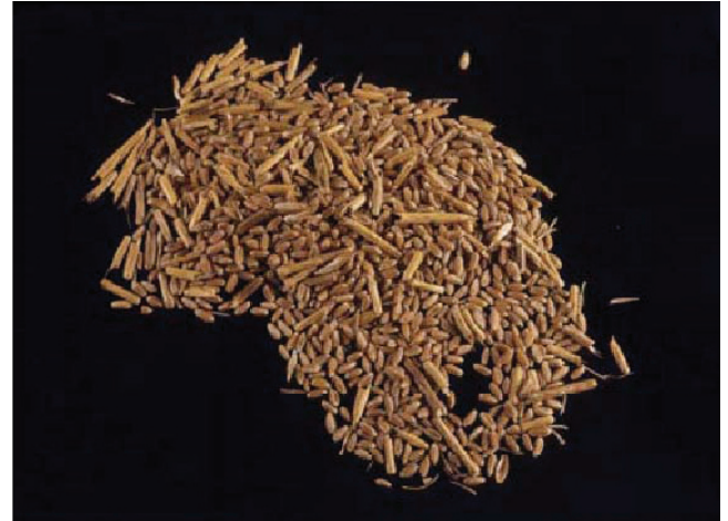
Figure 5. Winter wheat grain contaminated with jointed goatgrass spikelets (joints).